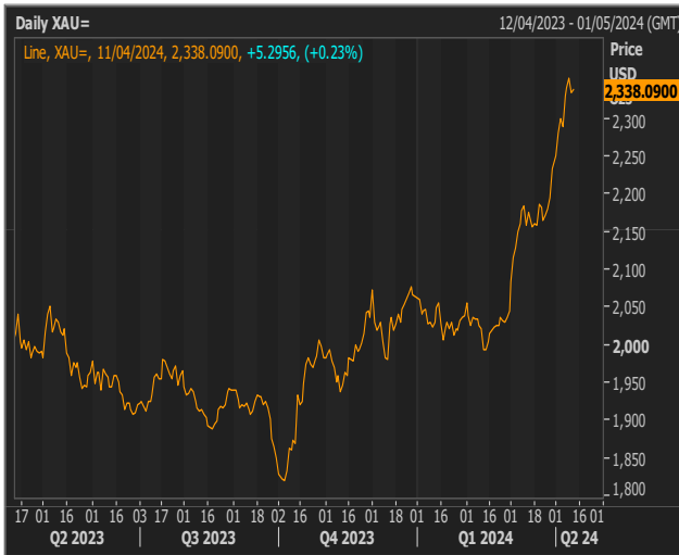
Graph 9. Gold: 12-month trend