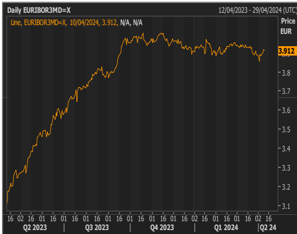
Graph 5. 3-month Euribor: 12-month trend