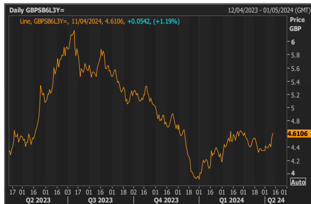
Graph 7. GBP 3-year swaps: 12-month trend