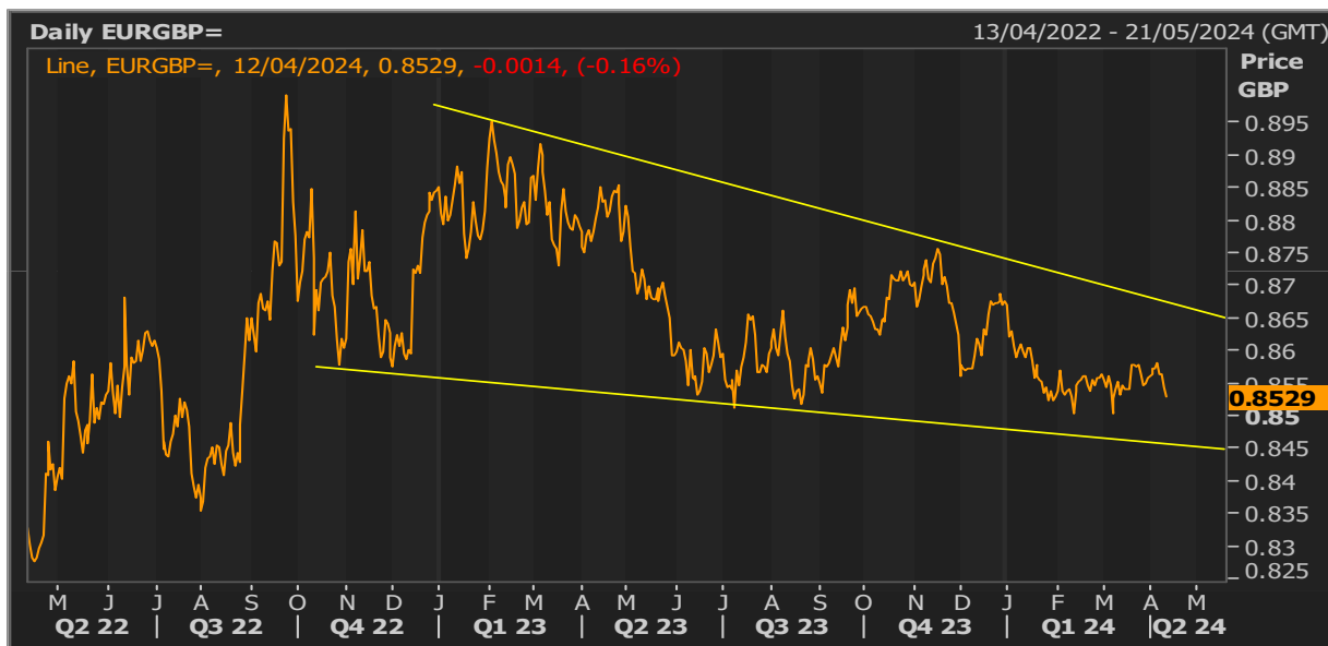
Graph 2. EUR/GBP: 2-year trend