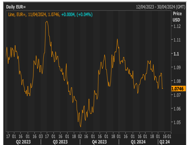
Graph 1. EUR/USD: 12-month trend