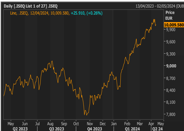
Graph 10. ISEQ: 12-month trend

In the UK, the FTSE had a more turbulent time over the course of 2023 and was the worst performer of the three indices that we monitor but it too has had a positive start to 2024. UK economic data has not been great but a lot of the FTSE 100 companies are global in nature and are not dependant on the UK consumer.