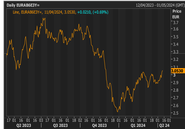
Graph 6. EUR 3-year swaps: 12-month trend